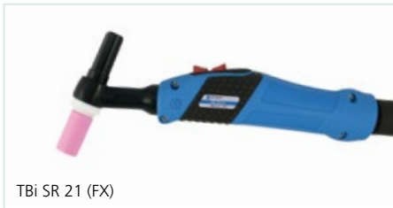
TBi SR 21 (FX)

wassergekühlt / water cooled / refroidissement par eau 100% (10 min.) AC: 160 A DC: 220 A Ø 0.5-3.2 mm