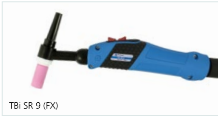
TBi SR 9 (FX)