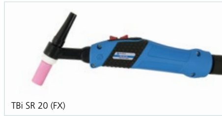
TBi SR 20 (FX)

Gasgekühlt / gas cooled / refroidissement par air 60% (10 min.) AC: 80 A DC: 110 A Ø 0.5-1.6 mm