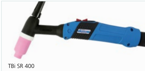
TBi SR 400